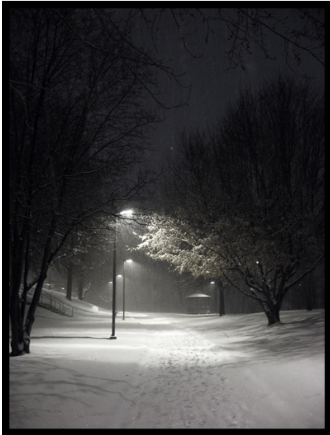
"The fallen snow" by Ashley Biess '09