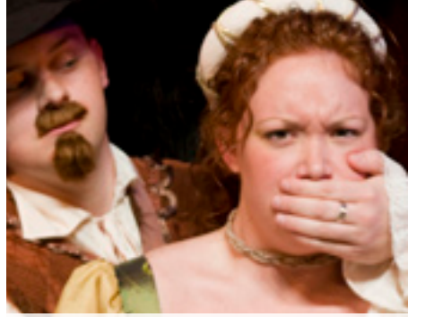
The Augustana College Theatre presented Shakespeare's The Taming of the Shrew last fall. Winter and spring productions are listed below.